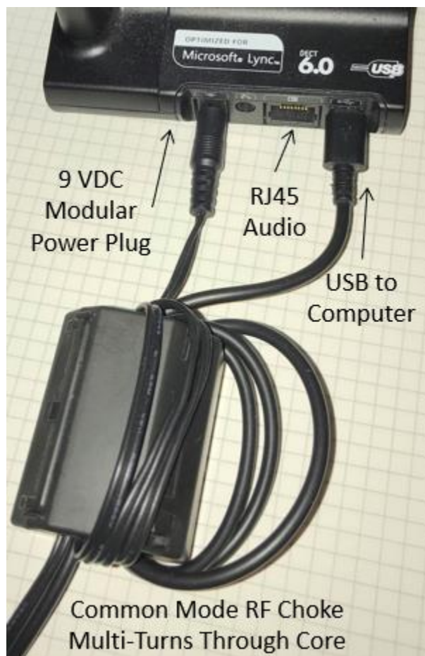
Figure 2. Fair-Rite Clamp-on Ferrite with Power and USB Cord Wrapped Around Core Multiple Times